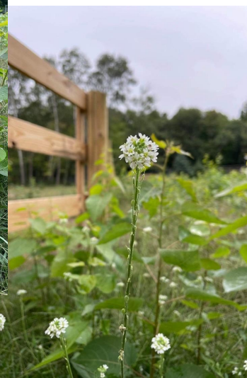
Both pictures are of hoary alyssum plants.